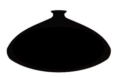
FLAT BOTTLE Tools Used 1 3 4