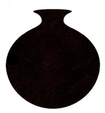
SPHERICAL VASE Tools Used 1 2 3 5