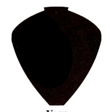
VASE Tools Used 1 2 3 5 A wide open top makes these forms easier to hollow out.