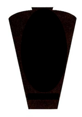
BOTTLE Tools Used 1 4 5