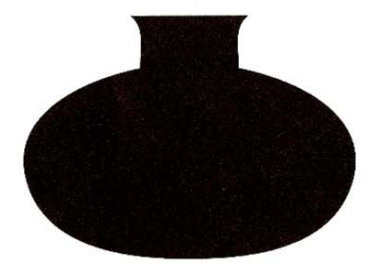
JAR Tools Used 1 2 5