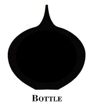
Tools Used 1 2 4 This is turned in two pieces. It is hollowed from the top with a "disguised" close fitting joint of the collar