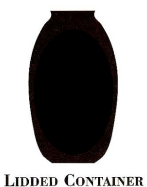
Tools Used 1 3 5 This form would follow the same steps as making a box – but larger.