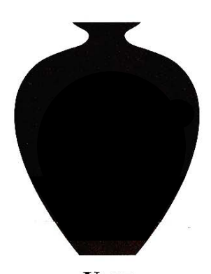
VASE Tools Used 1 2 3 5