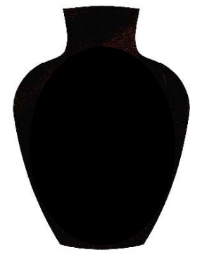
VASE Tools Used 1 2 5