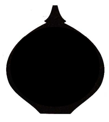
BOTTLE Tools Used 1 2 5