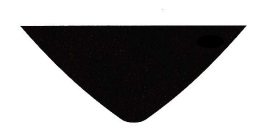
THIN WALLED BOWL Tools Used 1