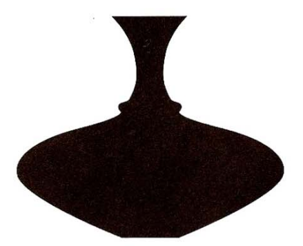
LONG NECKED BOTTLE Tools Used 1 2 4 5 Turned in 2 pieces with disguised join at the bottom of the neck.