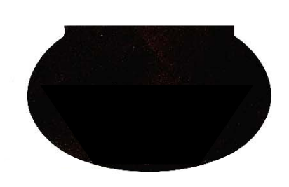
RIMMED BOWL Tools Used 1