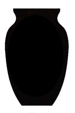
VASE Tools Used 1 2 3 5